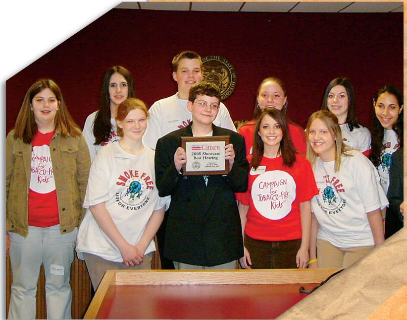
Students in Mexico, Missouri, are fighting secondhand smoke.

Taking Action The students next partnered with the Audrain County Team, a group that works against substance abuse, to help get their message out to the community. In a brochure that they wrote and distributed to medical offices, they included some of these facts, such as, "If you sit in a restaurant for two hours that allows smoking, you have smoked two cigarettes!" and information about cancer risks. In addition to their brochure, the students recorded radio announcements, wrote articles for the local newspaper, created anti-smoking stickers for restaurants to put on customers' bills, and visited smoke-free restaurants to award "thank you" certificates. The students' work continues; they hope that the City Council will pass a law banning smoking in all city restaurants. As they work toward that goal, the teens are collecting signatures in support of the law, drafting a sample law for the council, and informing local company owners that smoking may be bad for business.